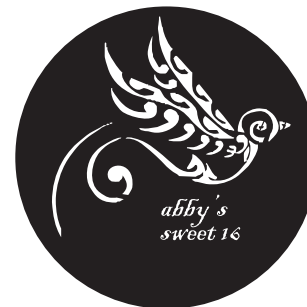
L10. Blackadder ITC