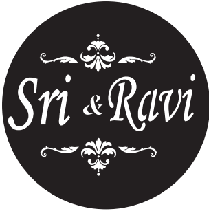
J3. Monotype Corsiva