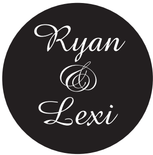
M5. Amazone BT Edwardian Script