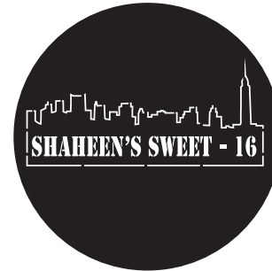
L4. Stencil Std Bold