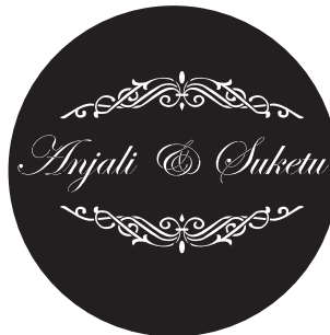
C8. Edwardian Script