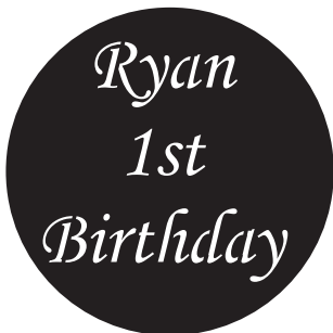
K7. Monotype Corsiva