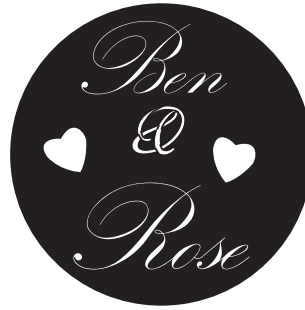
N4. Kunstler Script Sloop Script