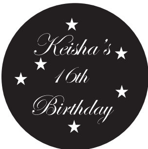
J9. Edwardian Font