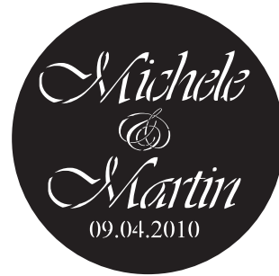
F4. Vivaldi Italic Edwardian Script Times New Roman