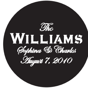
B4. Copperplate Gothic Bold Edwardian Script