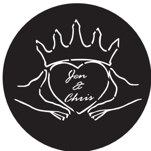
B9. Brush Script Std. Medium