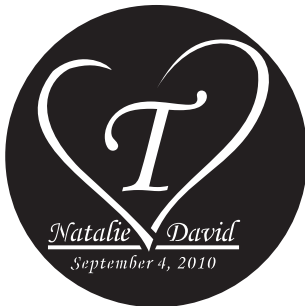
C9. Monotype Corsiva