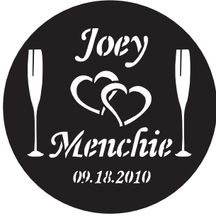
G3. Monotype Corsiva