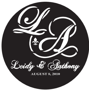
B5. Edwardian Script Chopin Script Trajan Pro