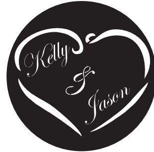
F2. Edwardian Script Palace Script