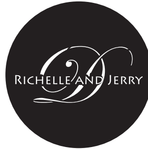
D4. Lithos Pro Edwardian