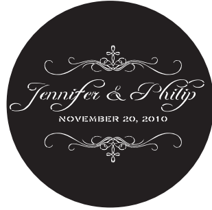
G4. Freebooter Script Copperplate Gothic Light