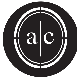
H10. Times New Roman