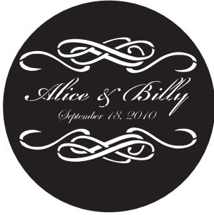
G1. Bickham Script Edwardian Script