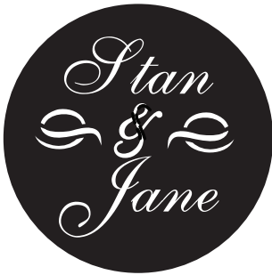
N5. ALS Script Bickham Script