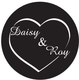
M7. Amazone BT Times New Roman