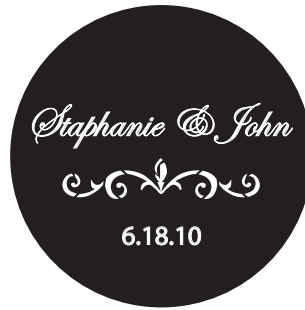
N6. Edwardian Script Copperplate Gothic