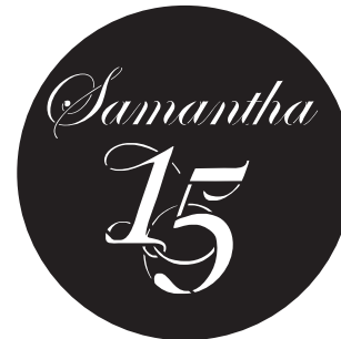
L6. Edwardian Script Mutlu Ornamental