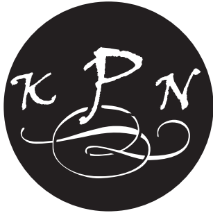
B3. Viner Hand ITC