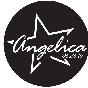
K2. Rage Italic