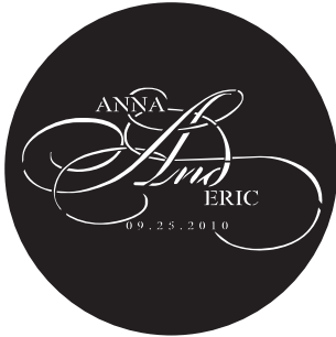
G5. Bickham Script Swash Times New Roman