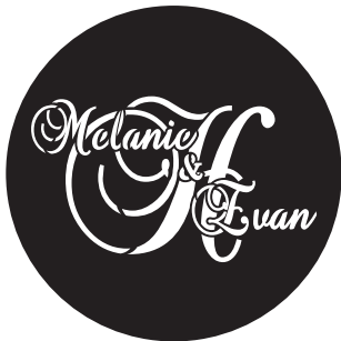
B7. Brock Script Times New Roman