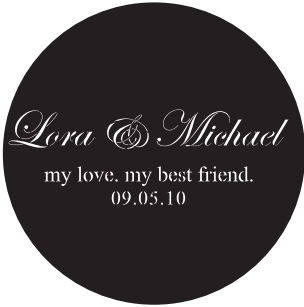
F1. Edwardian Script Times New Roman