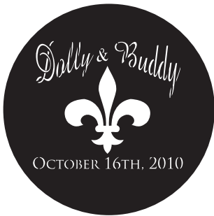
15. Amazone BT Times New Roman