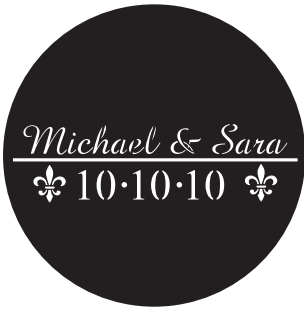
J1. Amazone BT Times New Roman