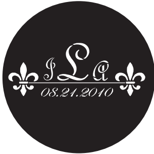
D3. French Script Edwardian Script