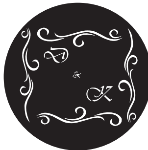
C10. Vivaldi Italic