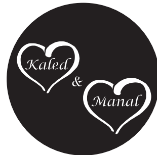
F8. Lucida Calligraphy Italic