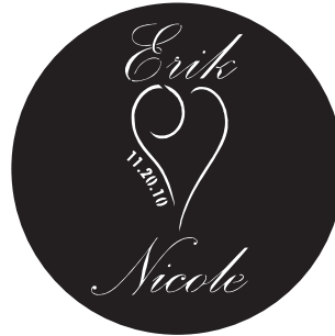
J8. Palace Script