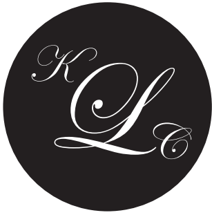
M1. Edwardian Script