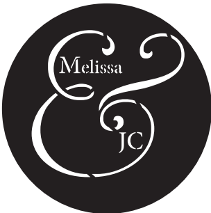
F7. Times New Roman