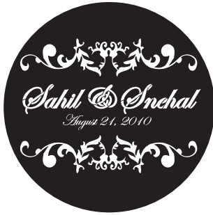
C1. Edwardian Script