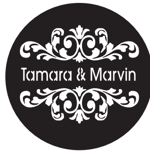
B6. Century Gothic