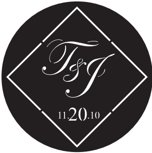
J7. Edwardian Script Palace Script Times New Roman