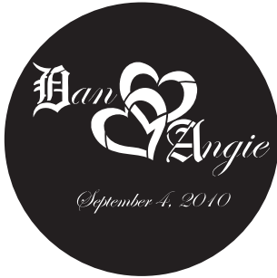
D1. Old English Text MT Edwardian Script