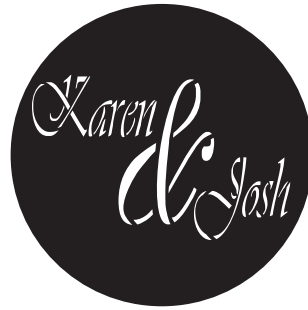
E4. Vivaldi Script English Script