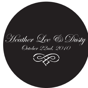
110. Edwardian Script