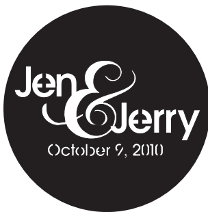
A9. Arial Chopin Script