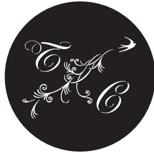
G6. Renaissance Regular