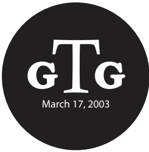
N1. Calisto MT Bell MT