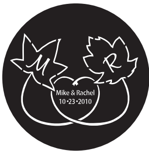
19. Honey Script SemiBold Arial