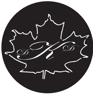
11. Kunstler Script