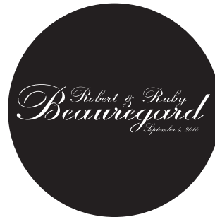
D6. Kunstler Script