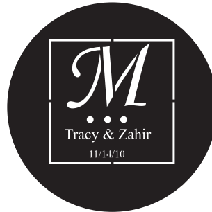
J6. Monotype Corsiva Times New Roman