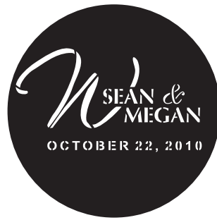
E2. Scriptina Pro Trajan Pro English Script Arial