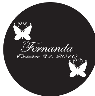
J10. Edwardian Script