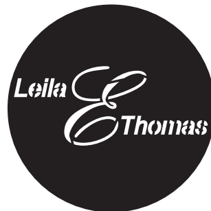
B10. English Script Arial