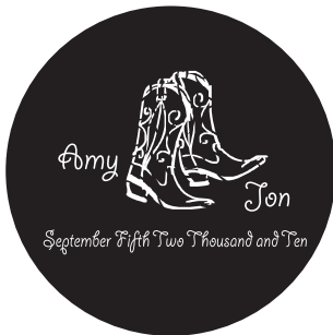
C7. Giddyup Std