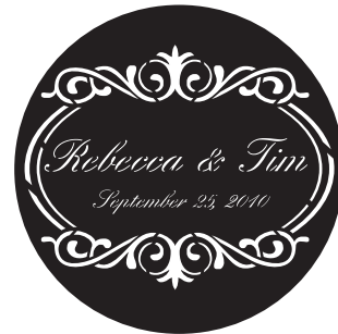
F6. English Script