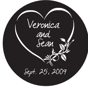
G2. Come Unto Me