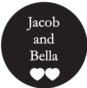
N9. Garamond Pro