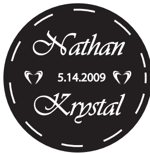
N7. Vivaldi Italic Times New Roman