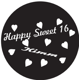
L5. Ariston Wd