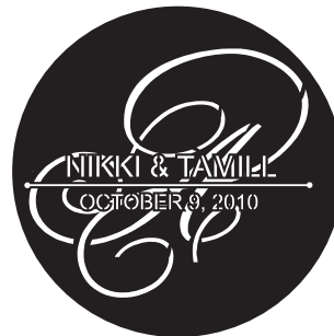
D8. Chopin Script Futura MT Bold