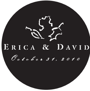
C3. Times New Roman Champagne Script