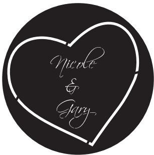
H5. Scriptina Pro