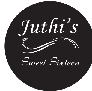
L8. Monotype Corsiva Gabrielle