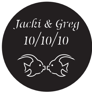
E1. Lucida Calligraphy Italic