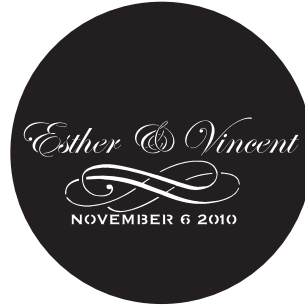
J4. Edwardian Script Trajan Prof