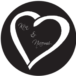
J5. Scriptina Pro