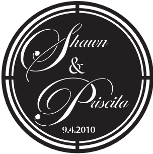
F3. Edwardian Script ALS Script Lucida Calligraphy Italic Times New Roman