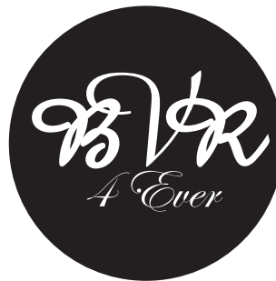
M8. Amazone BT Edwardian Script