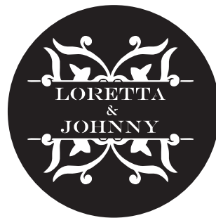
18. Times New Roman