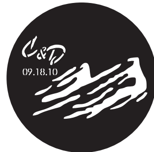
F10. Brush Script Arial