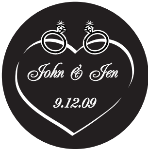
N3. Renaissance Regular