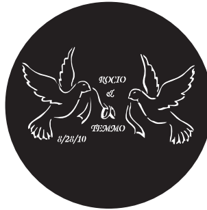
C2. Monotype Corsiva Times New Roman