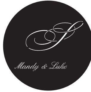
J2. Bickham Script Swash English Script