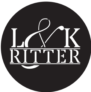
F9. Times New Roman