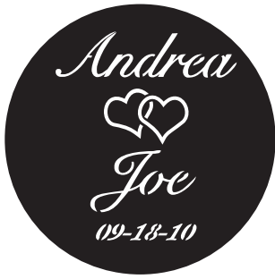
B1. Simmissa Times New Roman Italic