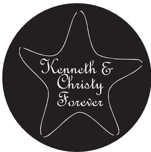
17. French Script