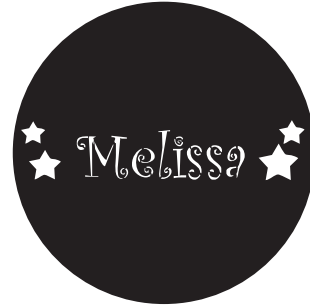
K4. Curlz MT