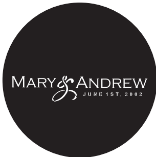
D7. Copperplate Gothic Light Arial