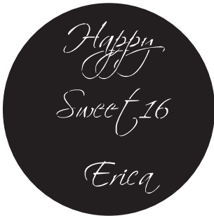
L7. Scriptina Pro