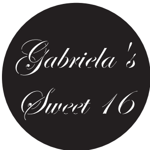
L9. Edwardian Script