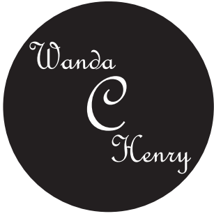
M3. French Script