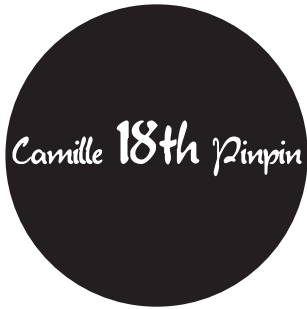
K1. Juliet Regular