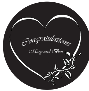
N2. Vivaldi Italic