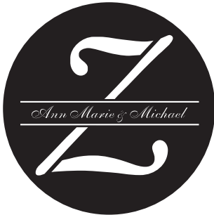
G7. Monotype Corsiva ALS Script Palace Script