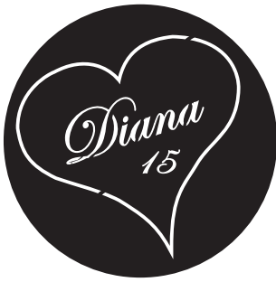
L1. Edwardian Script