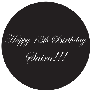
K5. Edwardian Script