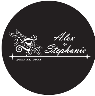
A3. Vladimir Script Lucinda Calligraphy