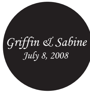
M2. Monotype Corsiva