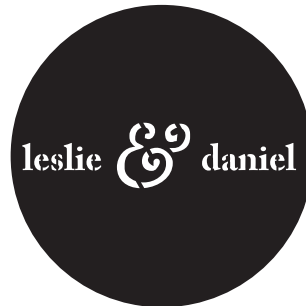
H8. Times New Roman