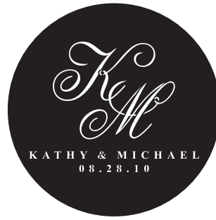
B2. Old Script Times New Roman