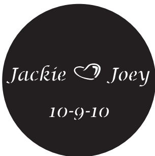
G9. Lucida Calligraphy Italic