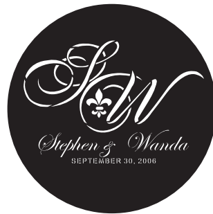
E8. Bickham Script Swash Sloop Script Edwardian Script Palace Script Arial