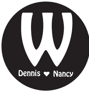
A5. Hobo Std. Medium