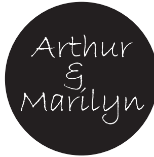
M4. Bradley Hand ITC