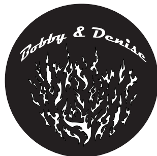
G10. Magneto Bold