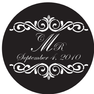
E9. Edwardian Script English Script