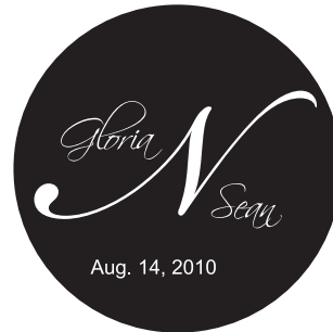
A10. Bickham Script Std Scriptina Pro Arial

Not all designs will fit every image area. Alterations may be made in some instances.